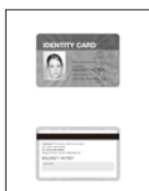
ID Copy Function

The bizhub 185/165 is a full-featured 3-in-1 MFP designed to meet printing, copying and scanning needs, yet be simple and intuitive to use. The operation panel features a Shortcut key, which can be freely assigned to one of four commonly used copy functions (Combine Original 2-in-1, Sort, Erase, and Book Separation), as well as an ID Copy key for copying both sides of small-sized documents to one page, function keys for instant access to print settings, numeric keys and a reset key. A unique LED Status Display and clear Error Status Indicator offer at-a-glance visual feedback even from a distance, while LED-backlighting ensures a bright, readable display. Routine maintenance tasks and paper replenishment have also been simplified to minimise downtime and maximise productivity.