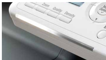
LED Status Display